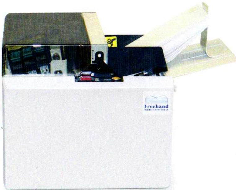
The FREEHAND Address Printer

As envelope printing becomes a larger part of your office's work load, you find that the laser printer just isn't made to do envelopes, at least not at the volume you're asking for. There's increasing opportunity to create simple direct mail pieces and use them to solicit new customers, but the technology in the office just doesn't support the effort, and your volume isn't interesting to the local mail shop.