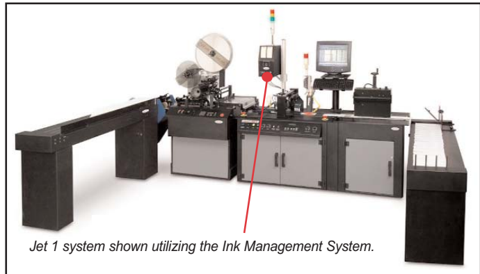
Jet 1 system shown utilizing the Ink Management System.

Adding the benefits of the Secap Ink Management System to the highly-productive, one person operated Jet 1 system makes this combination the ultimate solution in productivity and cost savings.